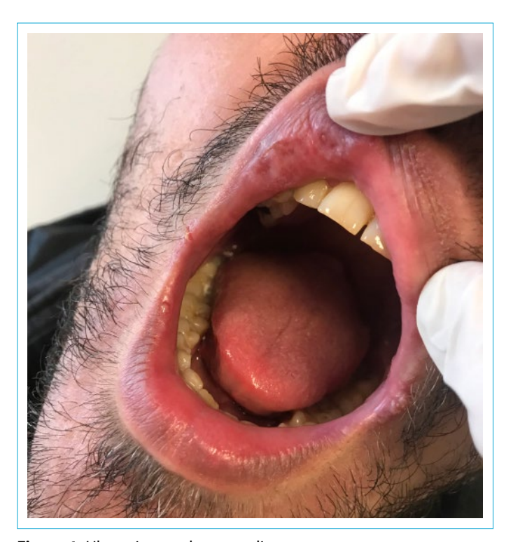
Figure 1. Ulceration on the upper lip.

causes bacteremia and the disease becomes a systemic infection. This secondary stage is characterized by wide variety of clinical symptoms involving the skin and the other organs as well as constitutional signs such as fever, malaise, myalgias, arthralgias, and generalized lymphadenopathy. [5,6] Skin lesions of secondary syphilis are varied and macular, papular, maculopapular, papulosquamous, lichenoid, nodular, and pustular lesions could be observed. Among them the most commonly observed clinical presentation is a generalized, non-pruritic papulosquamous eruption. These lesions could be confused with many other dermatological diseases such as viral exanthems, psoriasis, lichen planus. Symmetric macular eruption with papules may be present on palms and soles. [7,8] Different presentations are also possible. [9-11]