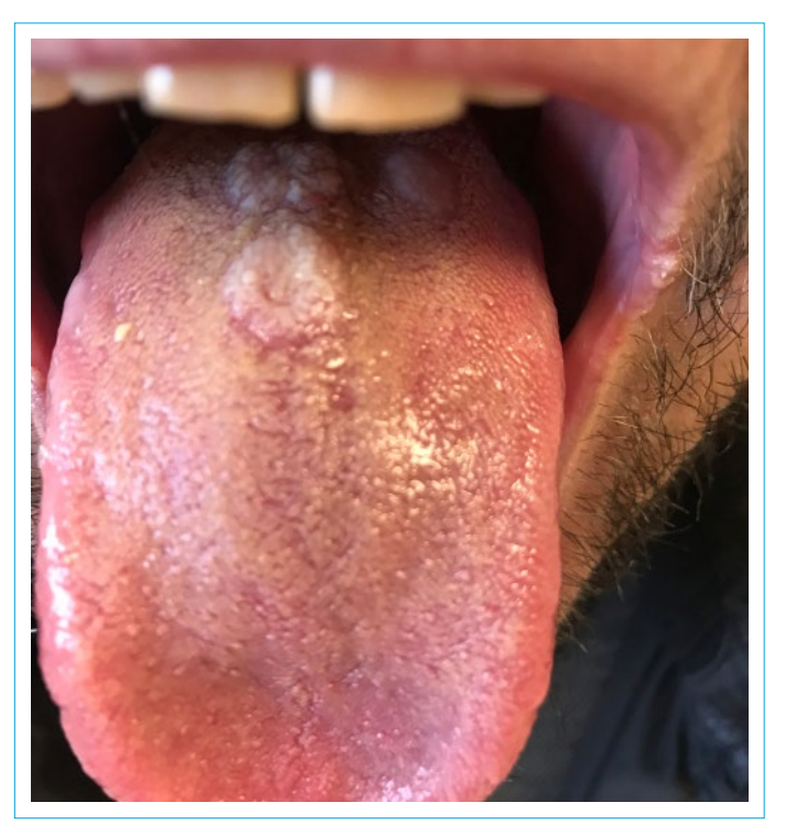
Figure 2. Mucous plagues on the dorsum of the tongue.

Syphilis has been increasing in incidence during the last years and it is still a disease of worldwide. Different clinical presentations of untreated syphilis may appear more often than we think. We should not miss the mucocutane-